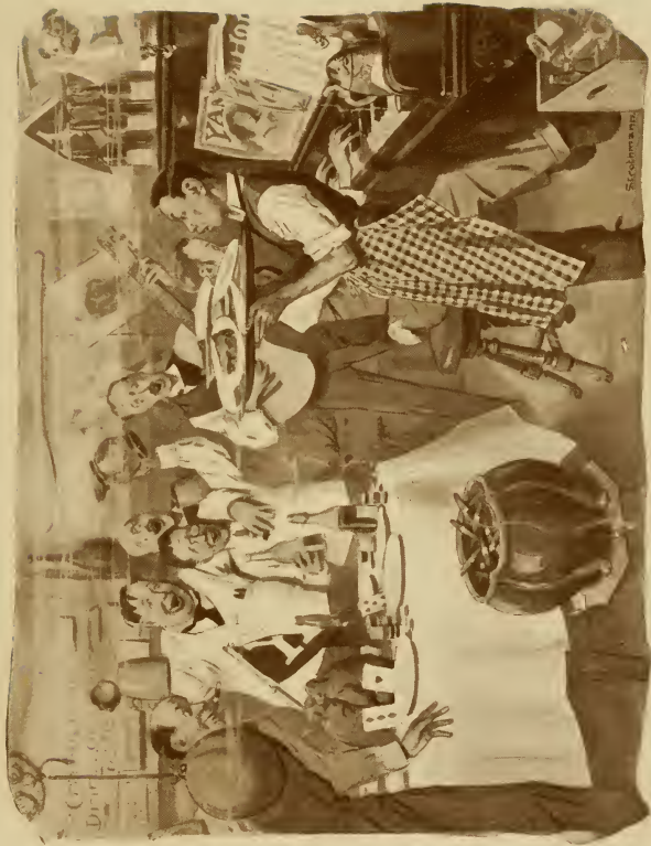
When I fetch forth raw steak and apple pie all require, "What the matter with Togo?"